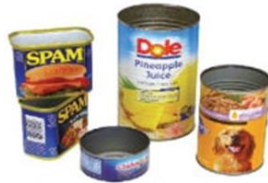
Clean metal food cans