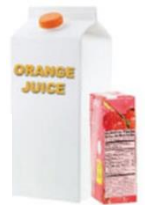
Paper Cartons - Milk cartons and juice boxes