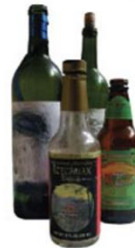
Glass jars & bottles