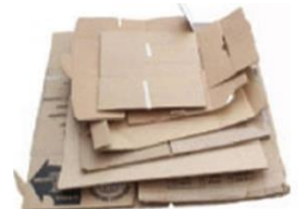
Corrugated cardboard (flattened)