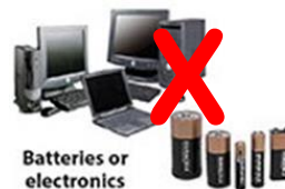
Batteries or electronics