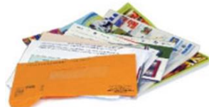
Mail, mixed paper, and catalogs