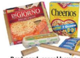
Boxboard, cereal boxes, frozen food boxes