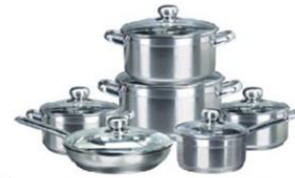
Pots & pans, scrap metal, ceramics